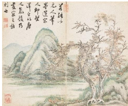
Album of painting (a part)