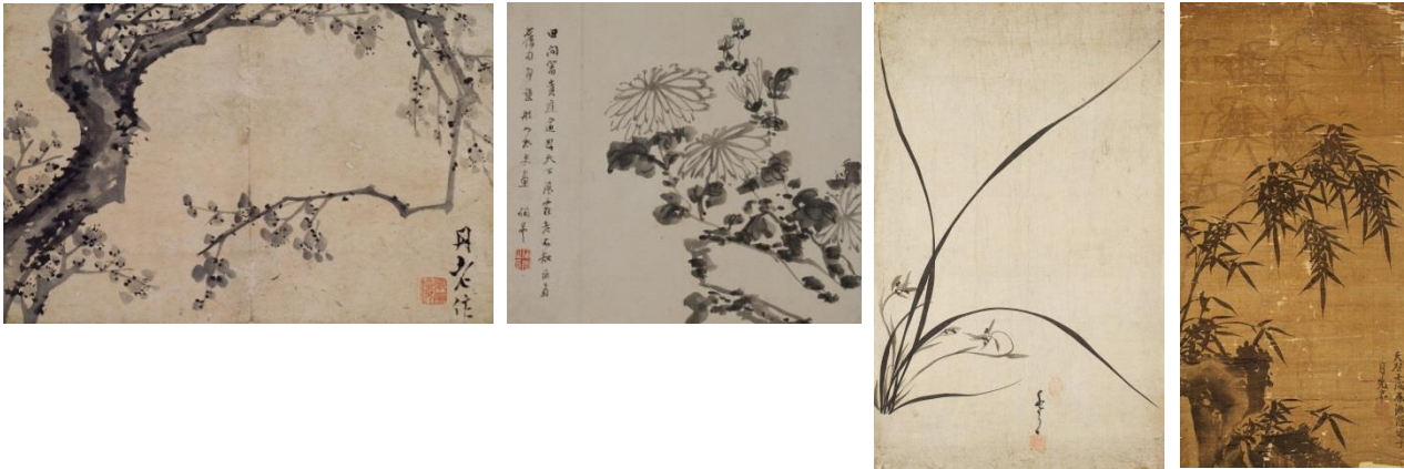
The Four Gentlemen (Four plants: Plum, Orchid, Chrysanthemum and Bamboo)