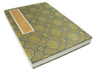
Album of painting